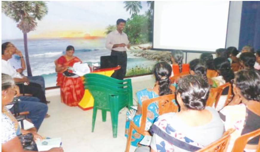
Women's Self Help Group Training - Nallur, Jaffna