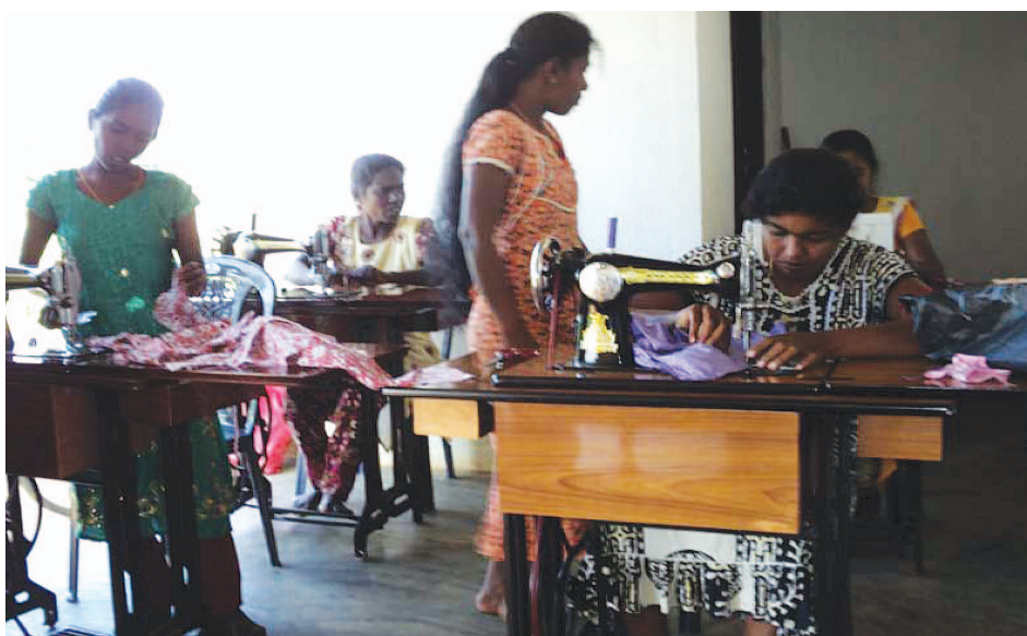
Tailoring training in Seethanaveli, Trincomalee

During the 2012-2013 period a total of 7,470 people benefited from OfERR's training activities.