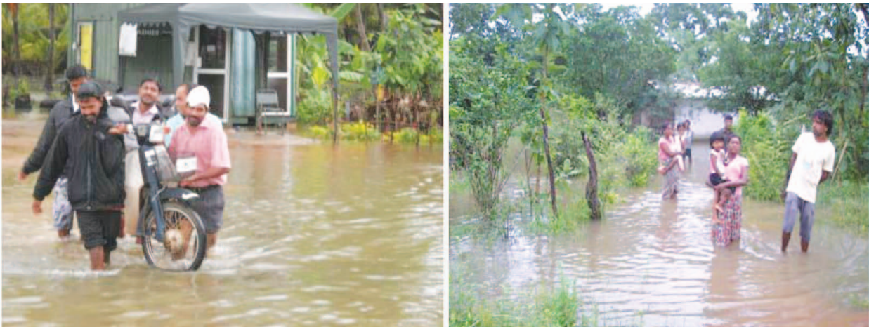
Flood damage in Eastern Province - December 2012

Above-average rainfall flooded many areas in the North and Eastern regions of Sri Lanka in December 2012 resulting in extensive flooding, flash floods, landslides and tank overflows. The most affected Districts were Batticaloa in the Eastern Province and Mannar and Mullaitivu in the Northern Province. An estimated 447,000 people were affected with widespread damage to homes, crops, schools and roads. Former internally displaced people, who recently returned to Mullaitivu, Kilinochchi, Vavuniya and Mannar Districts, were among the most affected.