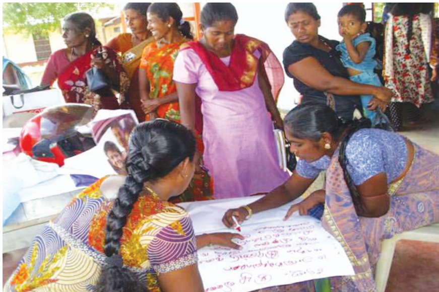
Women's Self Help Group Training