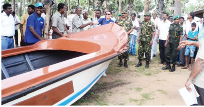
Livelihoods - Handing over boats to resettled fishing families in Thennamaravadi, Trincomalee District