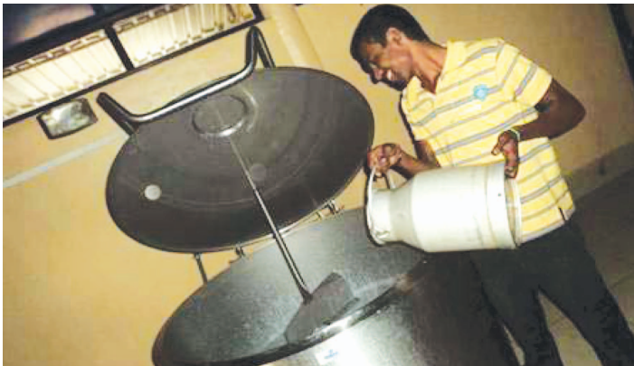
Milk Production - OfERR Ceylon, Trincomalee

OfERR works closely with returnees, local community organizations and government officials to identify those refugees and returnees requiring and eligible for livelihood support. OfERR provided the necessary inputs such as livestock (cattle and goats), paddy seeds, cashew plants, water pumps, delivery pipes, fencing materials, sprayers, etc. to enable many newly settled families to begin farming again. A total of 2288 returnees families in the areas of Trincomalee, Batticaloa, Vavuniya and Mannar were able to resume their livelihood activities in 2012-2013.