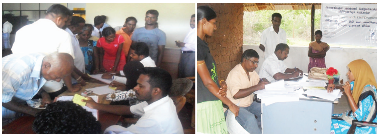
OfERR staff assist returnees with their civil documents

In 2012-2013 more than 35,147 returnees – recent and former returnees from India, as well as IDP returnees - successfully obtained their documentation thanks to the work of OfERR and its regional offices. OfERR's assistance comes in the form of information meetings about documents, organizing mobile documentation clinics, providing financial assistance with the cost of travel to government centres and occasional fee payment for documents.