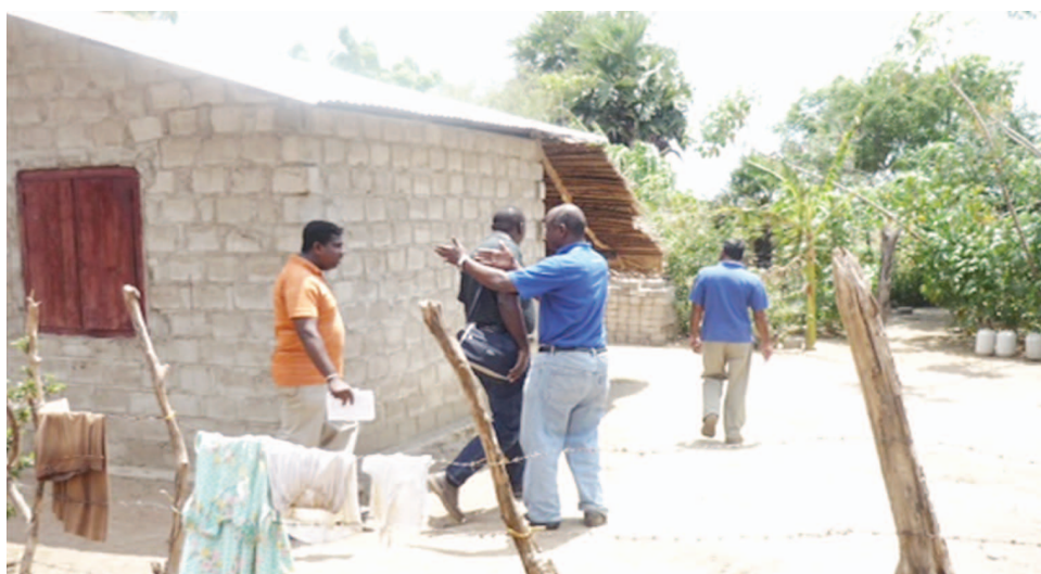
“OfERR-UNHCR repair of damaged homes - Muthur, Trincomalee”

Advocacy - OfERR continues to meet with representatives of the Sri Lankan and Indian Governments to discuss the importance of establishing a Memorandum of Understanding (MOU) between the two governments and the refugee communities. A frame-work for return is essential to ensure the safety and well-being of returnees, as well as to enable the returnees to rebuild their lives in dignity and peace. OfERR Ceylon believes an MOU would instill in refugees the confidence of a safe return to their villages in Sri Lanka, thereby encouraging more refugees to make the journey home.