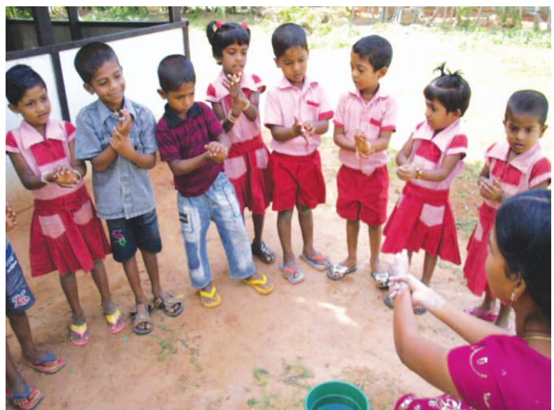
International Hand-washing Day at new pre-schools