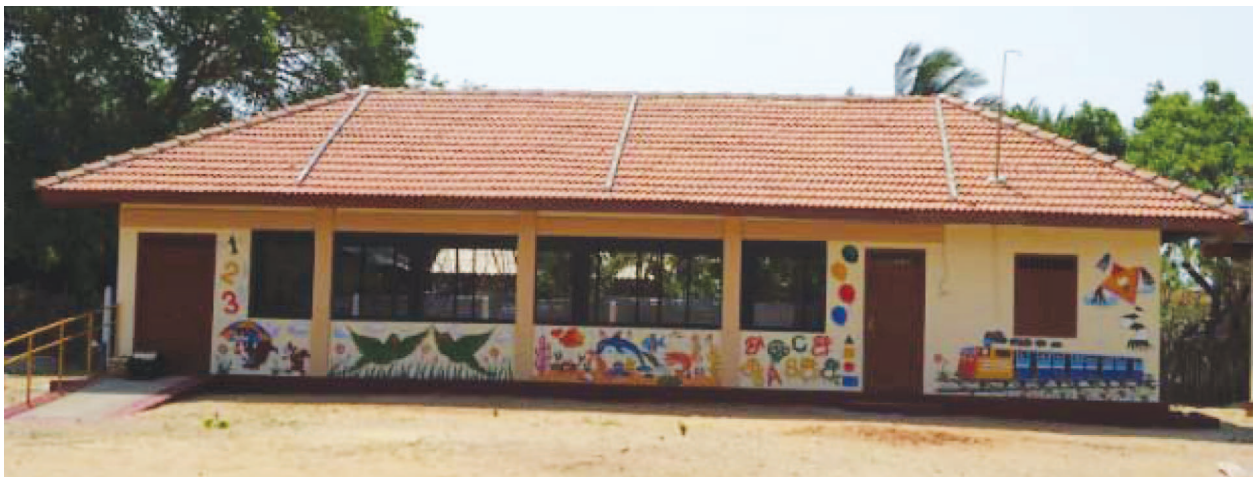
Saraswathy New Pre-School

Twenty-eight playgrounds were rehabilitated with new play equipment constructed with local materials. Sixty childcare providers followed an ECD diploma course helping them to increase their skills and motivation. All of these activities resulted in a major increase (50%) in children attending early childhood development centres and a 50% improvement in knowledge, attitude and practices of child rights and child protection among the communities and child care providers.