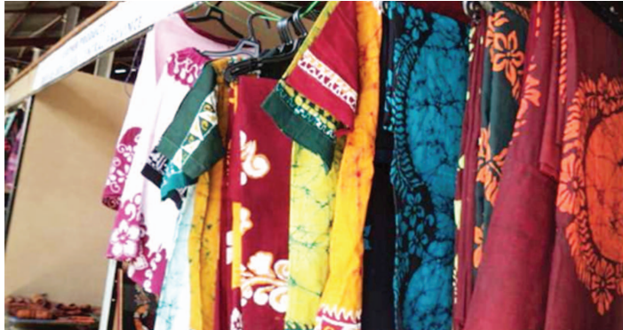
Small Enterprise - Batik Store - Trincomalee