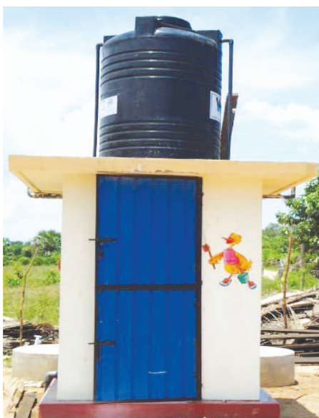
New toilet and well - ECDC-Mullaitivu District