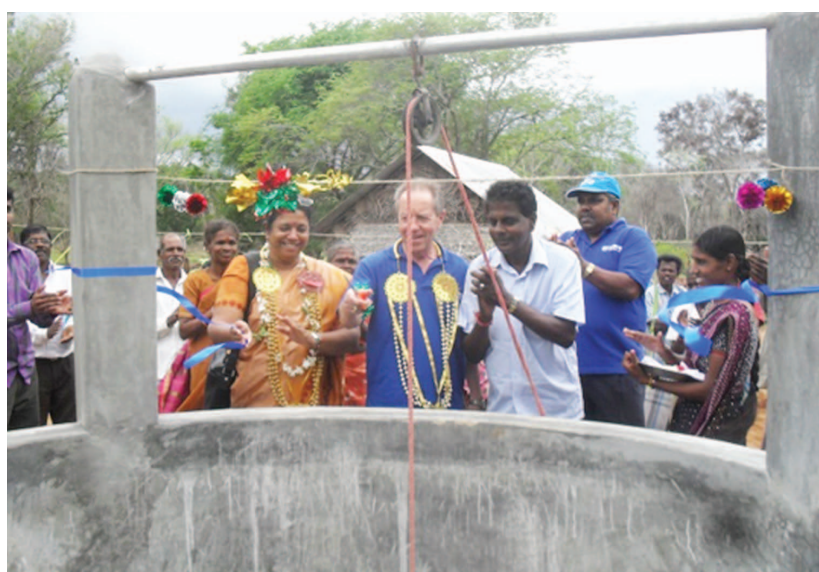
UNHCR and OfERR - inaugurate common well in Mannar.

Many common wells were constructed to enable families to get water for their day-to-day domestic use. These wells were also used for home gardening by the people in those areas. Assistance was provided by the UNHCR for 8 potable water wells in Mannar and Vavuniya.