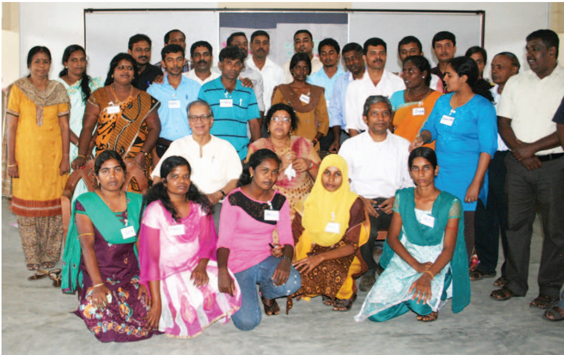
OfERR staff and volunteers at Child Protection Training Seminar - Trincomalee

Kreston MNS & Co. P.O. Box 210, No. 50/210 Sir James Peiris Mawatha, Colombo 2