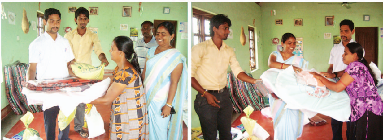
OfERR distributing flood relief packets in Batticaloa District, December 2012

OfERR Ceylon, with help from the ACT Alliance of Churches and specifically, Danchurchaid, ensured that emergency food rations - rice, dahl, milk powder, cooking oil, bed mats and mosquito nets - were provided to flood victims (2,938 families or 12,084 individuals) in the temporary shelters in Mannar, Vavuniya, Mullaitivu, Batticaloa and Trincomalee Districts.