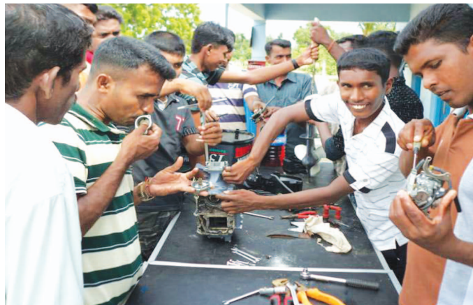
Outboard Motor Training - Batticaloa.